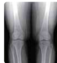
Both knees Weight bearing Foot LAT