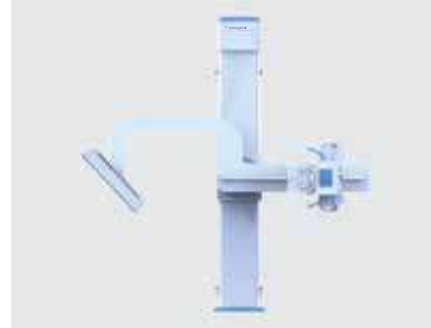
180° large angle rotation of X—ray tube match with other imaging equipment for rapid imaging