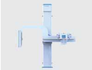
Detector 90° rotation to meet a variety of special angle Radiography needs